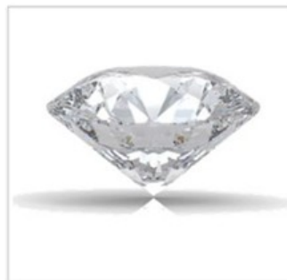
Vision To clarify and focus